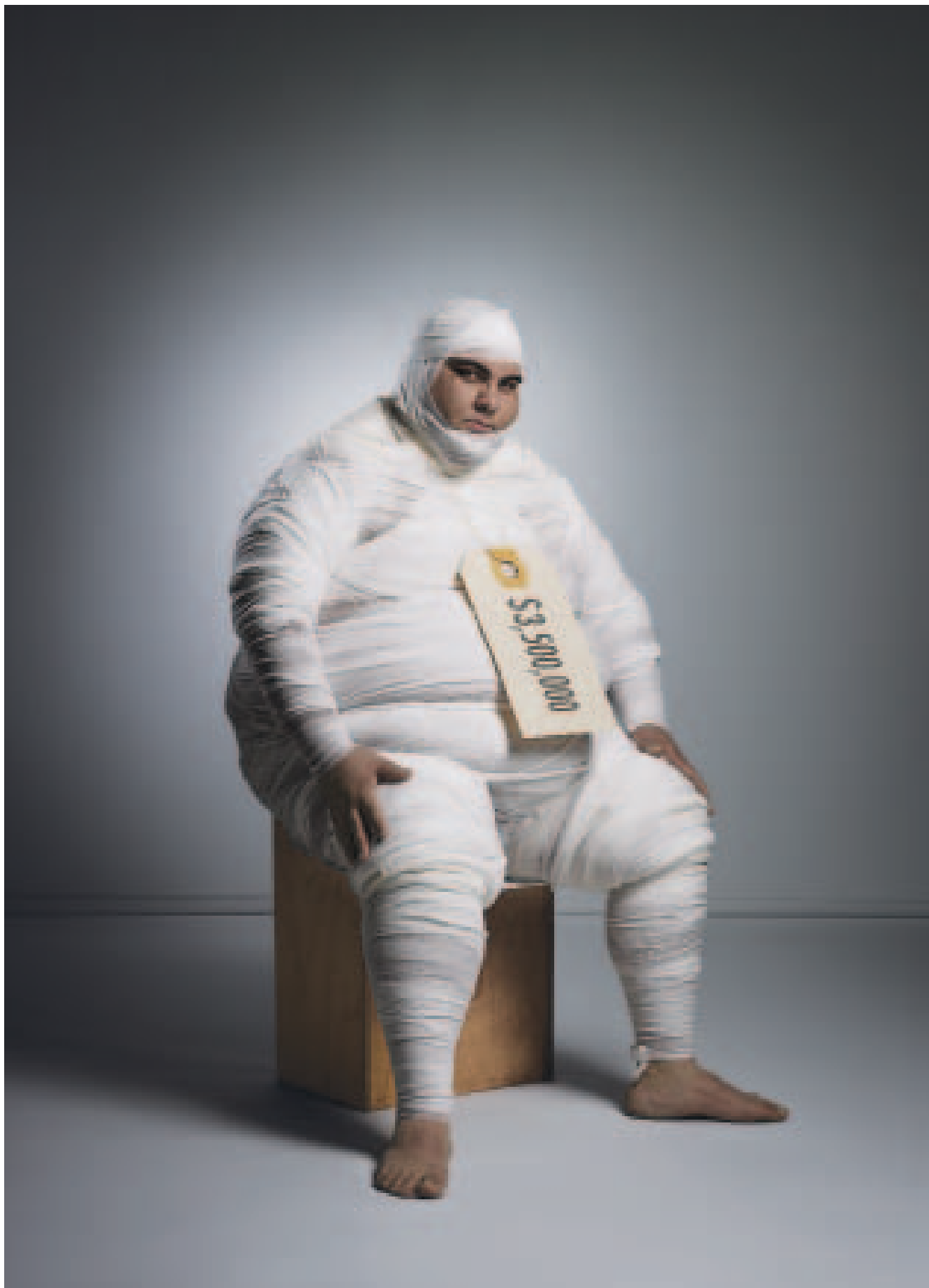
In Camden, New Jersey, one per cent of patients account for a third of the city's medical costs.